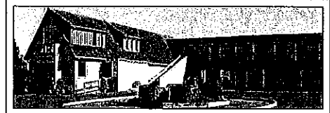
1960'S above -1977 below

Undaunted, Vern Brown rebuilt and enlarged the motel, creating 17 units for year-round tourist accommodations. A row of six motel rooms was built west of Beach Loop Drive, just below street level, in 1977.